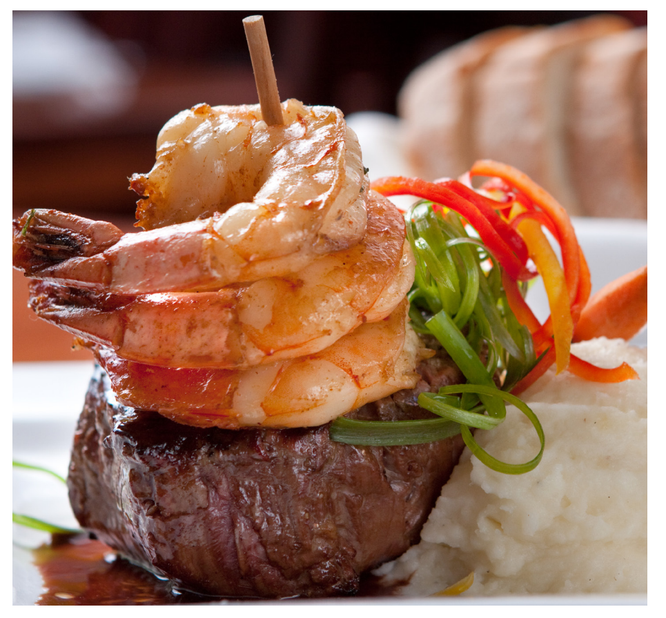
Menu selections are due 30 days out from your event. Guarantee count is due 5 business days prior to your event. All menus are subject to 7% sales tax and 23% service charge. Pricing subject to change based on market conditions.

Plated dinners are designed for a minimum of 10 guests and priced per person. Plated dinners include house salad with ranch and vinagrette<sup>®</sup> dressing, freshly baked artisan bread, and choice of up to two alternating desserts. Menu service includes Starbucks<sup>®</sup> Pike Place<sup>®</sup> regular and decaffeinated coffee, iced tea. All duet plates can be made dairy free and gluten free upon advance request to your Event Coordinator.